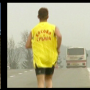
A 9 DAY RUN FOR KOSOVO

After centuries of struggle and loses a free people finally completes its goal.